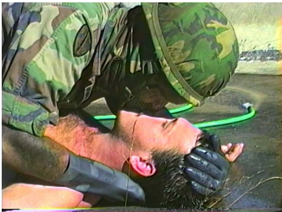
Still from a Palm Drive video